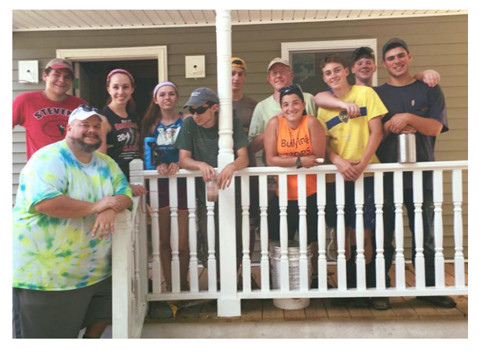
Members of the 2015 Mission Trip posing after a hard-day's work. This year's group will need your support. Sign-ups for food to send with our workers, which they use for meals, snacks and sustenance, will be coming soon.

SAVE THE DATES: THIS YEAR'S MISSION TRIP WILL TAKE PLACE JULY 24-30, 2016!