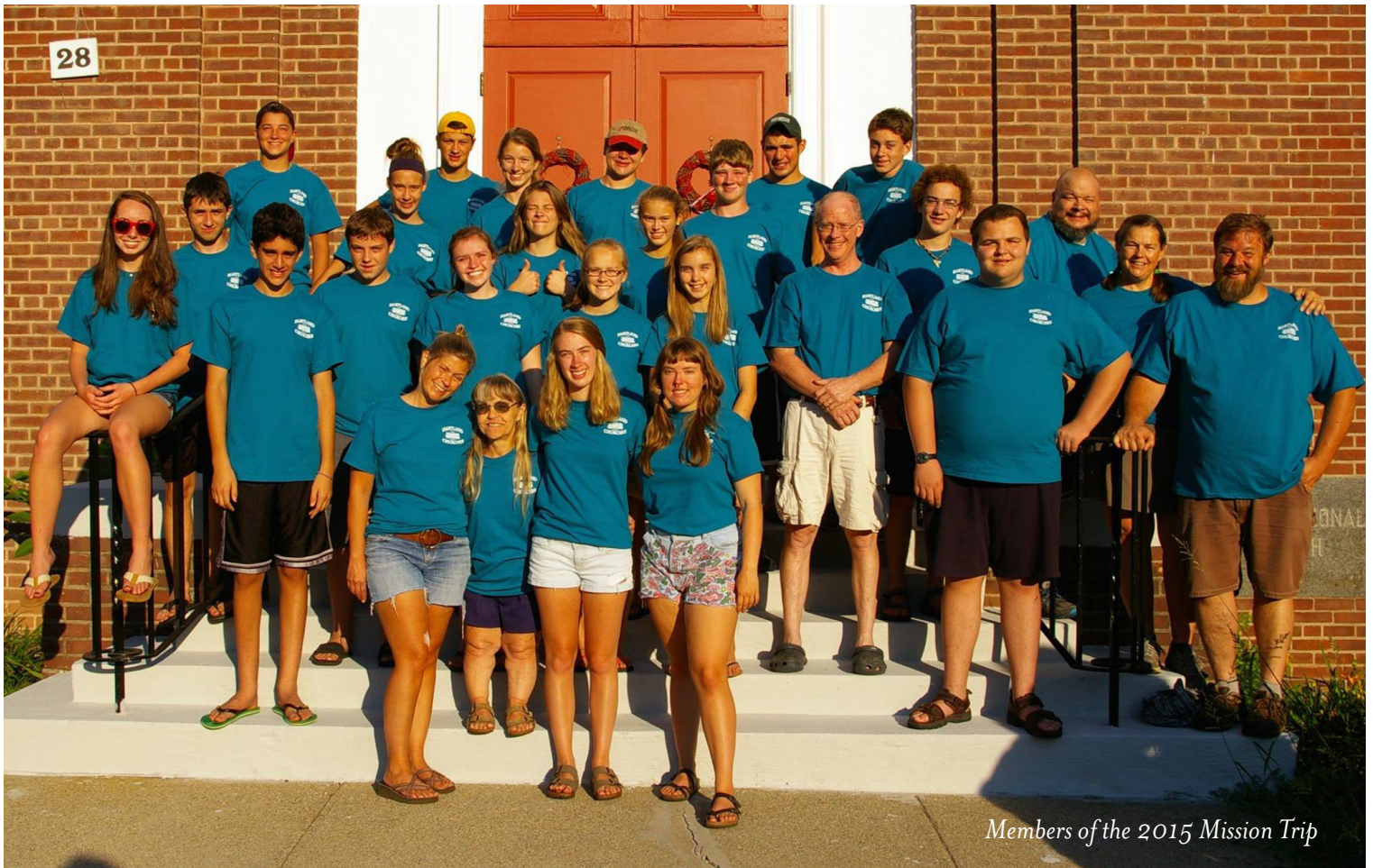
Members of the 2015 Mission Trip

Our congregation offers activities for youth in grades 7-12 (or the homeschool equivalent) through two youth groups—the Junior Youth Group, for those in grades 7 & 8 , and the Senior Youth Group for high school students . Both groups are offered in