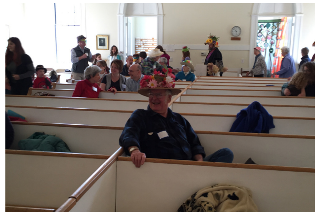
Our silly and sweet April Fools service, April 2016