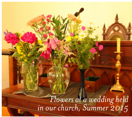
Flowers at a wedding held in our church, Summer 2015