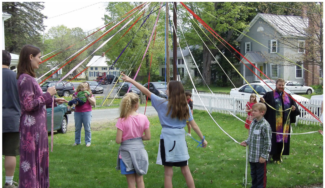
Maypole dance in celebration of Beltane, May 2011