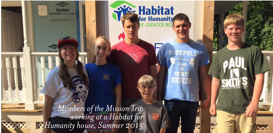
Members of the Mission Trip working at a Habitat for Humanity house, Summer 2015