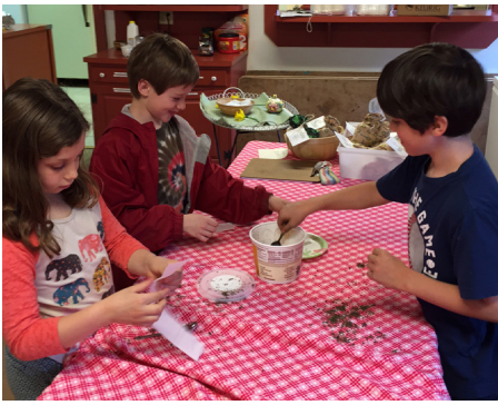
Making Mother's Day gifts during RE

DURING THESE LAST TEN YEARS, MY SENSE OF HOPE AND LOVE FOR THIS COMMUNITY AND OUR MINISTRY TOGETHER HAS CERTAINLY CHANGED, BUT IT'S NEVER DIMINISHED. IN FACT, I FIND THAT IT'S EXPANDED, AS THE DEPTH OF OUR RELATIONSHIPS, AND OF OUR SHARED EXPERIENCE HAS GROWN.