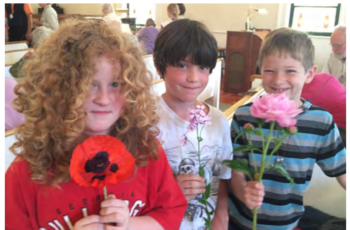
Some of our children at the annual Children's Service