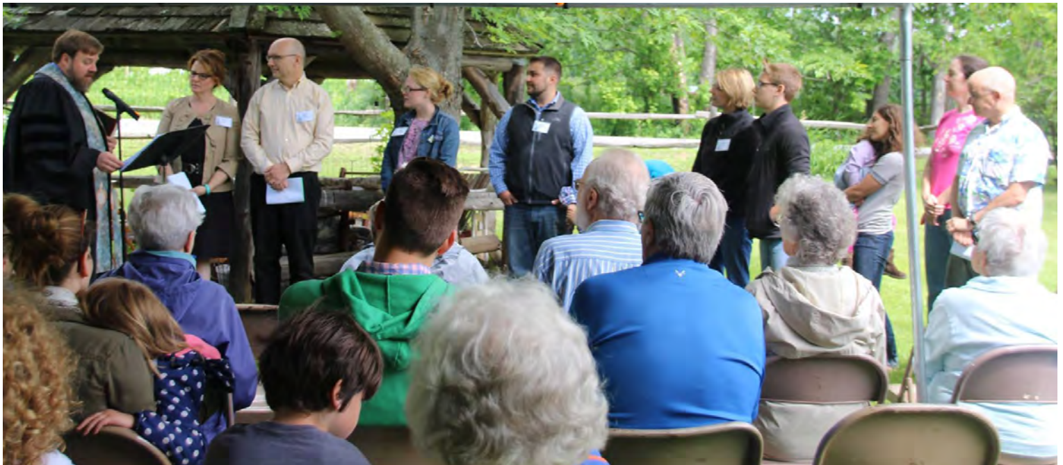
New members at our annual tent service.