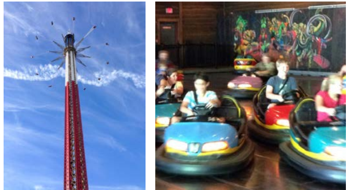
Throwback: Youth group members at the 2014 trip to Six Flags