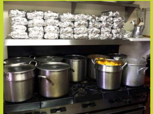
Stove with pots boiling, steam rising and 30+ dozen homemade rolls waiting for one of the 2014 Turkey supper's rush of eaters.