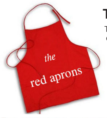
Be a guest at your own party