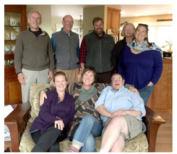
The church governing board at the October day-long meeting.