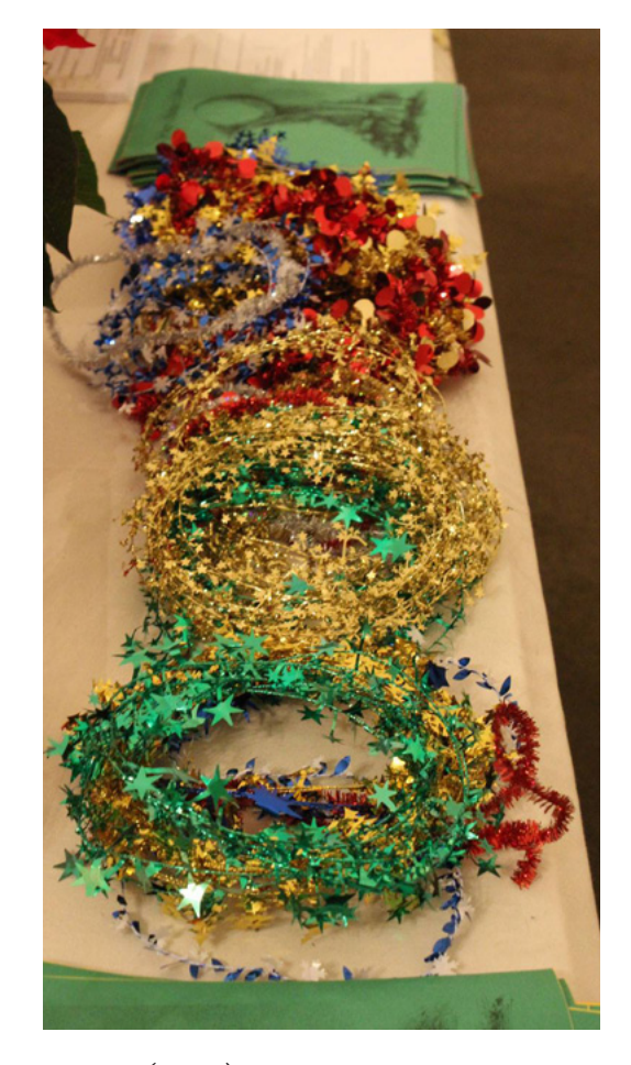
Crowns (above) from our 2014 Solstice service.

A few younger members of our community enjoy an early 2014 snowfall.