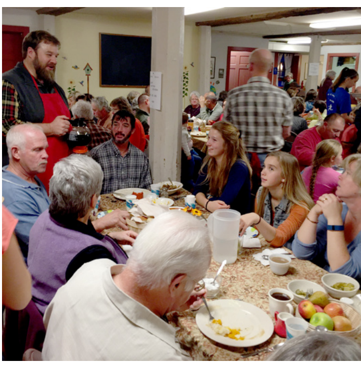
Thank you to everyone for helping to make these events so much fun and a successful fundraiser for our church community.