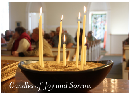
Candles of Joy and Sorrow