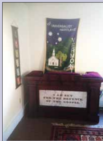
The Ballou Pulpit, resting happily in our church office