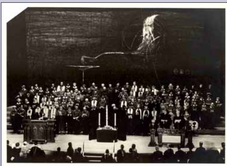
The Ballou Pulpit on the stage at Symphony Hall at the founding of the UUA

The importance of this pulpit in our faith tradition lies not only in its original history, but in a more recent event as well. In May of 1961, the Ballou Pulpit was chosen to represent the Universalist Church of America on the stage of Symphony Hall in Boston at the celebration ceremony for the consolidation of the UCA with the American Unitarian Association to form our present Unitarian Universalist Association. William Ellery Channing's pulpit from the old Federal Street Church in Boston stood for the Unitarian side.