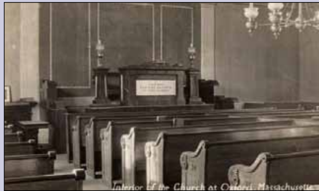
The interior of the Oxford, MA Universalist Church in the mid-19th Century

If you've been in the church office in the last couple of months, you may have noticed a new, large addition to the décor. At the end of last year, we were asked to serve as the caretakers of an important artifact of Universalist History.