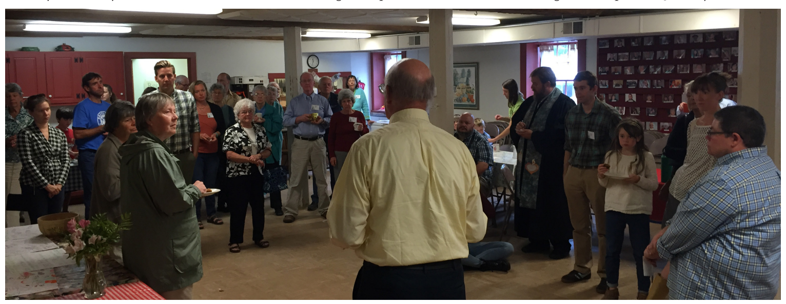
Thank you to everyone who attended our annual meeting on September 18. Our next meeting will take place in January, 2017.