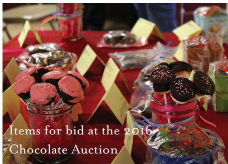
Items for bid at the 2016 Chocolate Auction